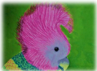
Figure 2 Pink by Cluida G and Jade H