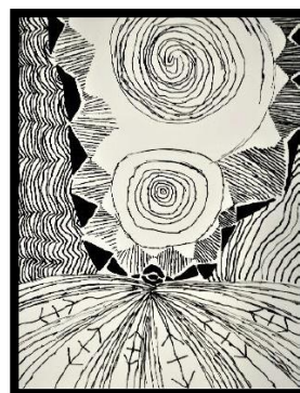
Figure 3 Vortex by Asher C