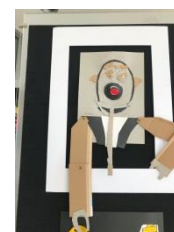
Open Arms-Campbell M