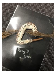
Fantastic Beast-Rory D,