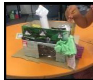
A building that could float on water